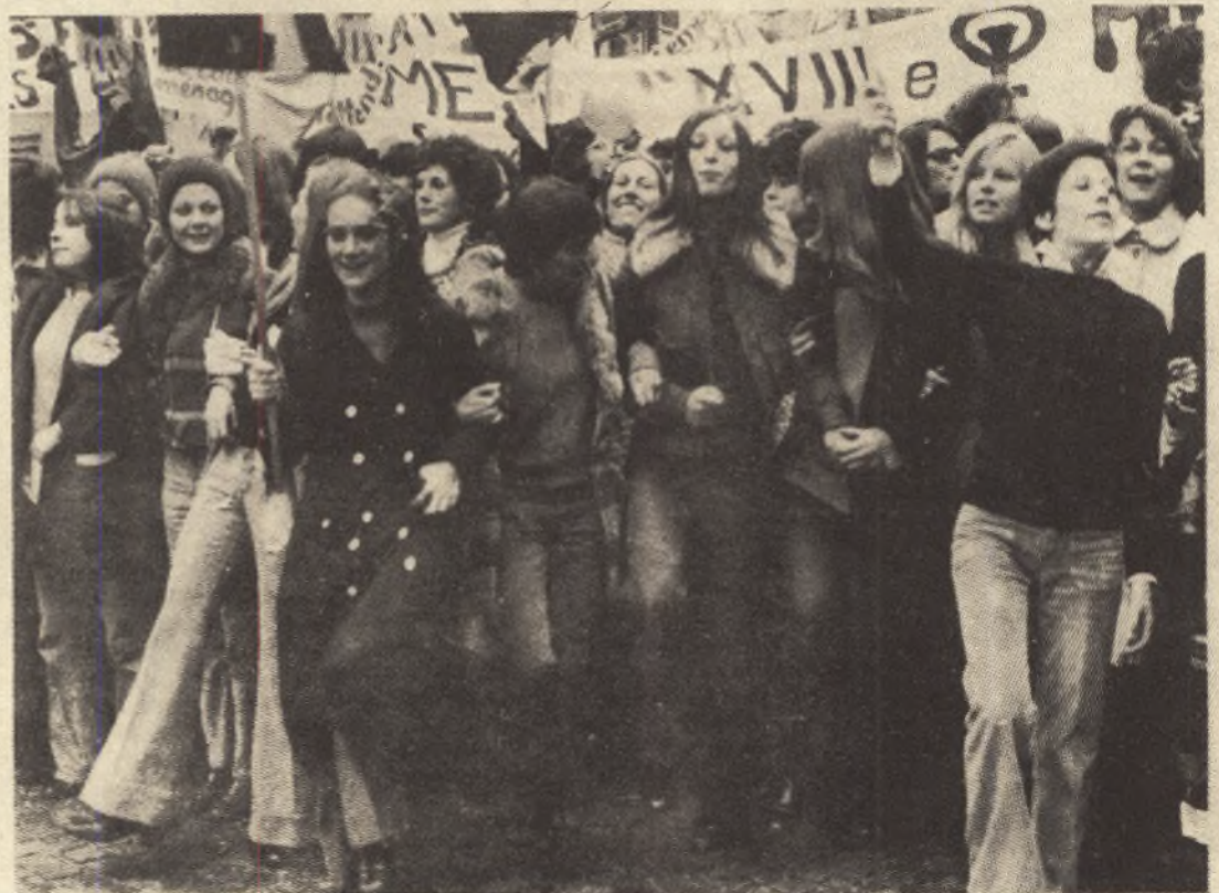
France—"Women Take to the Streets"—international demonstration for abortion law repeal and freedom for women, November 20, 1971