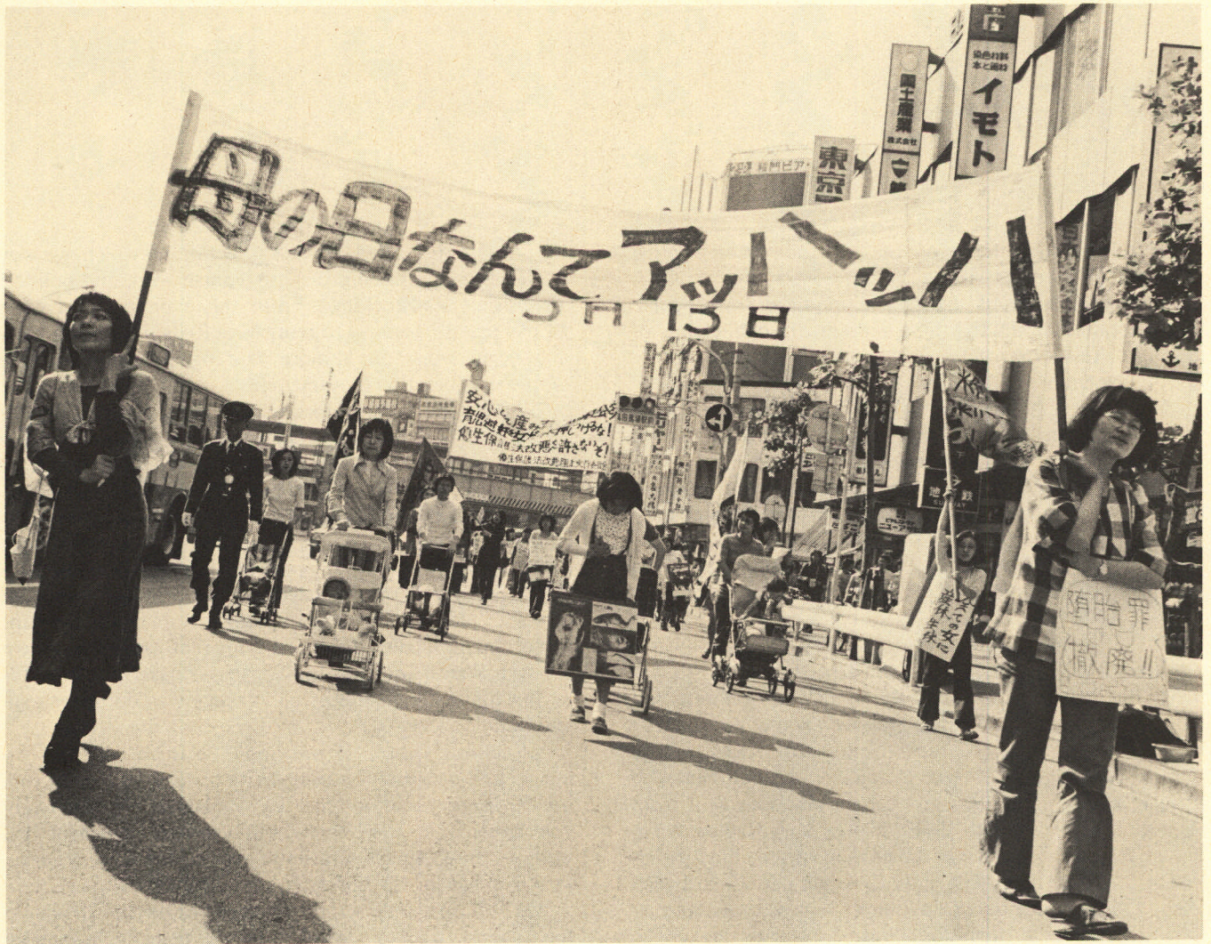
Japan—"Mother's Day is Bullshit" Parade, May 1973