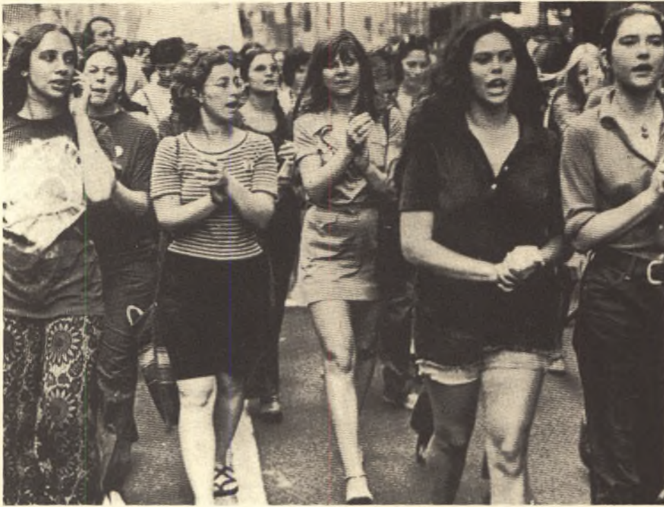
U.S.A.—Women Strike for Equality, August 26, 1970