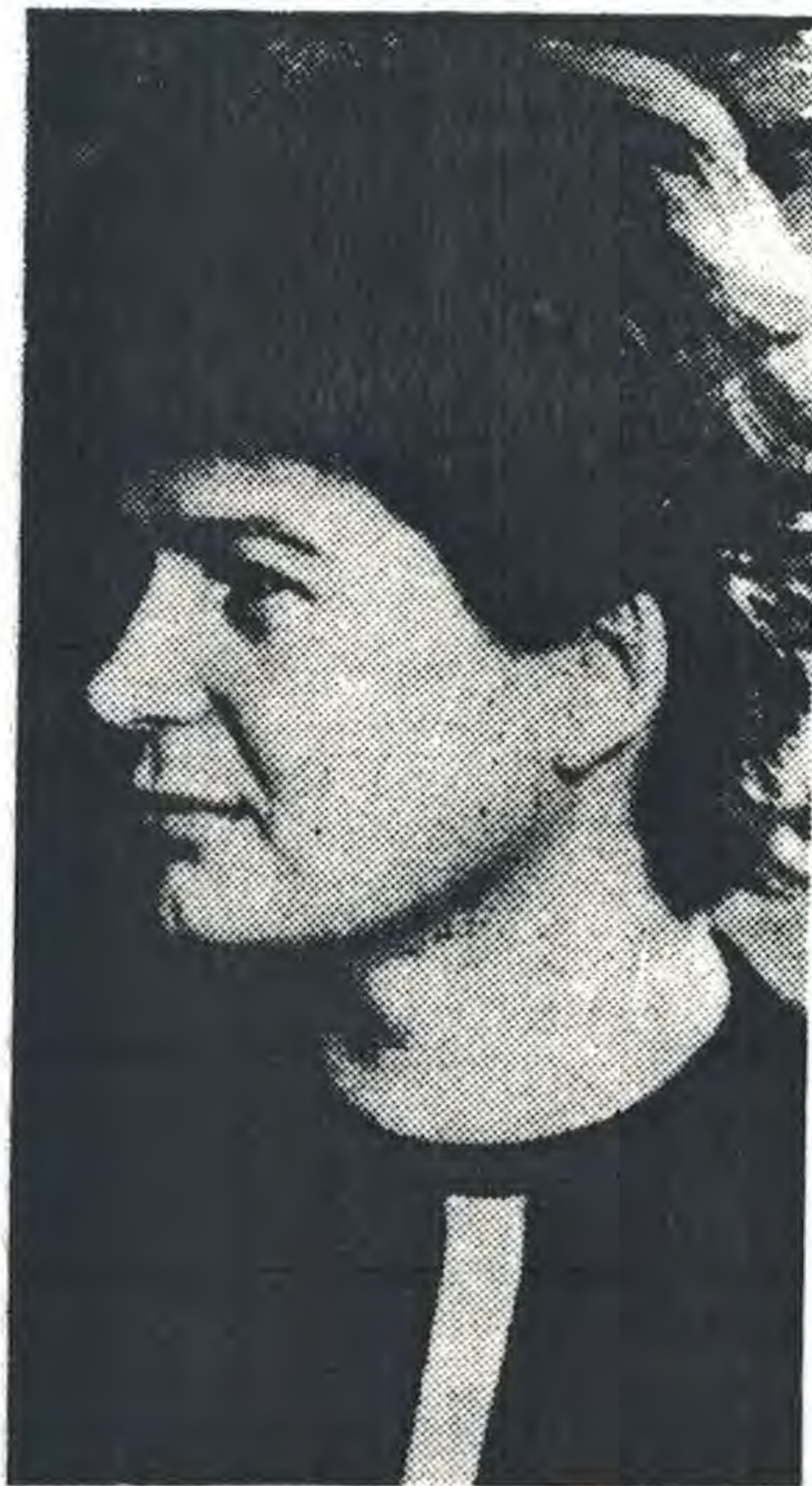
VALENTINA N. TERESHKOVA

Soviet women have prepared a report entitled "Women and Work." Mrs. Tereshkova stressed the importance of this theme. Although one-third of all those working in the world are women they still do not get equal pay for their work in a number of countries, she said. In many countries, conditions have not been established to enable women to combine work and family duties.